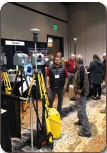
Exhibit Hall Layout