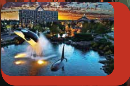
Tulalip Resort & Casino- Tulalip, WA