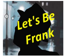
EXHIBIT AND SPONSORSHIP PROSPECTUS

March 3 - 6, 2010 - Hotel Murano, Tacoma, Washington